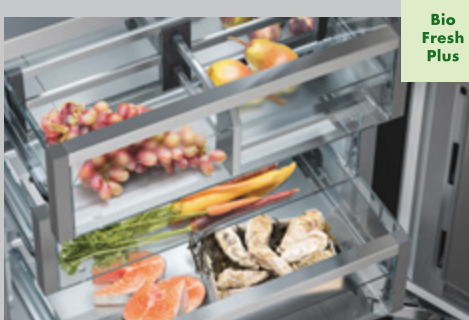
Bio Fresh Plus

SuperQuiet: Noise levels are kept to a minimum thanks to virtually silent, speed-controlled, and sound absorbing compressors. Alongside a low noise cooling circuit, these features ensure exact performance, energy efficiency, and SuperQuiet operation.